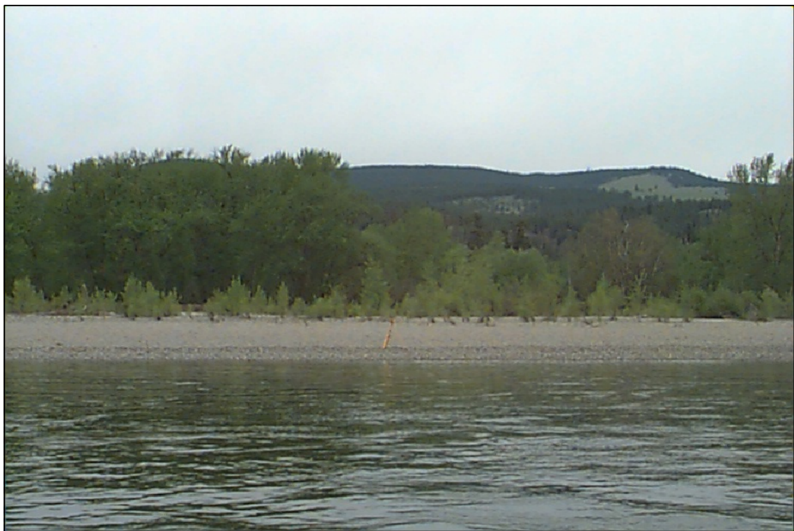
RIGHT BANK VIEW