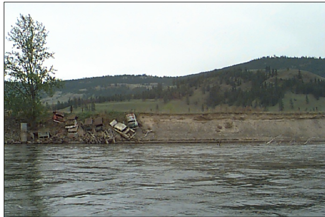
LEFT BANK VIEW